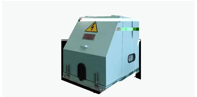
Special Dock Socket Box for Container Ship

The ship-shore connection subsystem mainly includes two parts: dock socket box and cable management system (required for some types of ship). The dock socket box is installed at the front of the dock, and the ship-shore electrical circuit is established by plugging in cables to shorten the connection time. The dock socket box maintenance door is provided with a travel switch and an interlock corresponding output switch to provide interlock protection for the maintenance work.