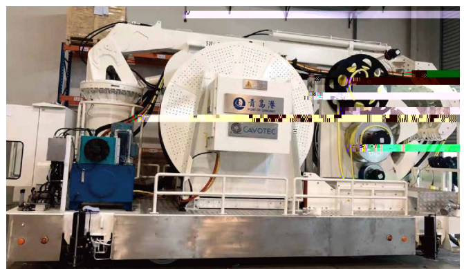
Special Cable Management System for Cruise