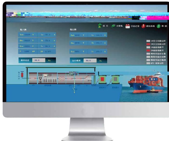
Shore Power Monitoring System

The data comprehensive monitoring subsystem not only monitors each device, but also communicates with the terminal monitoring system, which is convenient for the operator to grasp the operation status of the device. The monitoring system should record the output voltage and current data (including the necessary waveforms) during power supply, so that when the power supply is abnormally interrupted, the state of the fault can be traced back and the cause of the fault can be analyzed.